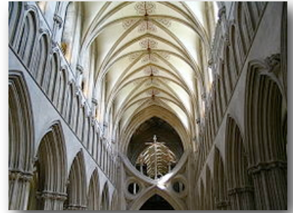
English Gothic architecture common in 1500s, Wells Cathedral

Questions from Crossroads , Chapter 1 (p.4-11) -- pre-read p. 0-3