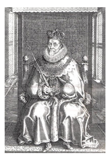
King James I of England

4. Why were the Puritans called dissenters? Whose teachings did they follow? Where did persecuted Puritans go?